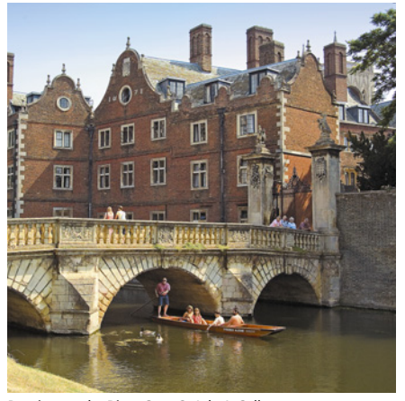
Punting on the River Cam, St John's College

Gain professionally by networking with your peers. Scan the horizon for new privacy issues and enjoy the unique summer school atmosphere.